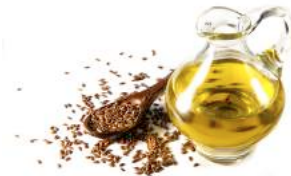
FLAX OIL OR GROUND FLAX