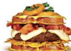
FOODS WITH TRANS FATS