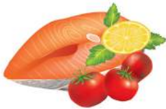
FISH LIKE MACKEREL, SALMON, SARDINES