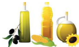
VEGETABLE OILS LIKE CORN, SUNFLOWER SAFFLOWER, SOYBEAN