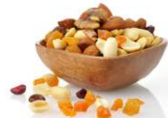
MIXED NUTS AND SEEDS