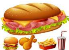
PROCESSED FOODS HIGH IN SATURATED FATS